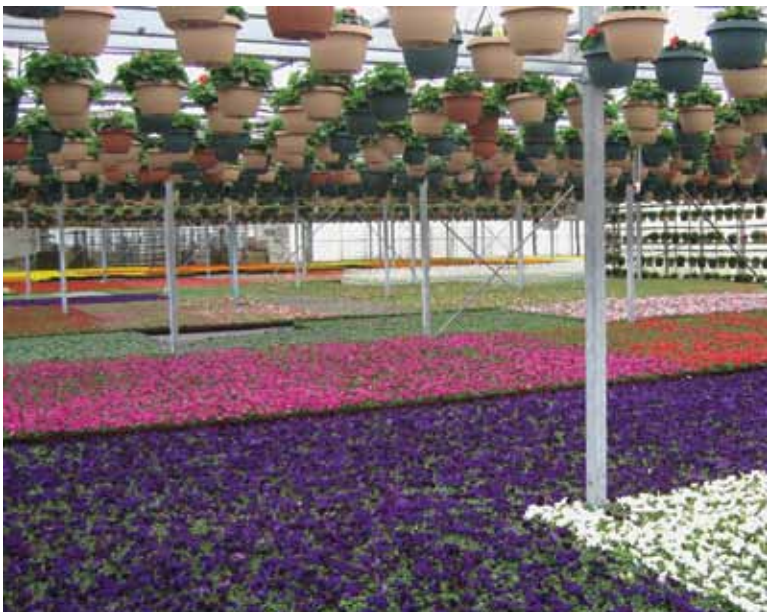
Figure 1. Sprech applications of PGRs have become more popular on aggressive bedding plant crops such as petunia.

I've noticed an increasing trend in the use of sprech applications of plant growth retardants (PGRs), especially by large-scale commercial growers. A sprech is a hybrid of a spray and a drench application; it is applied overhead either as a high-volume spray (usually by booms) or lightly watered-in with a hose. The PGR solution is applied so that the shoots are covered and a modest amount penetrates the surface of the growing media. While sprays are typically applied at a volume of 2 to 3 quarts per 100 square feet, sprechches are roughly three times that volume, or 6 to 8 quarts per 100 square feet. Sprechches are usually only applied to plants growing in their final containers (Figure 1).