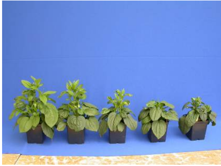
Sumagic @ 0, 15, 30, 45, 60