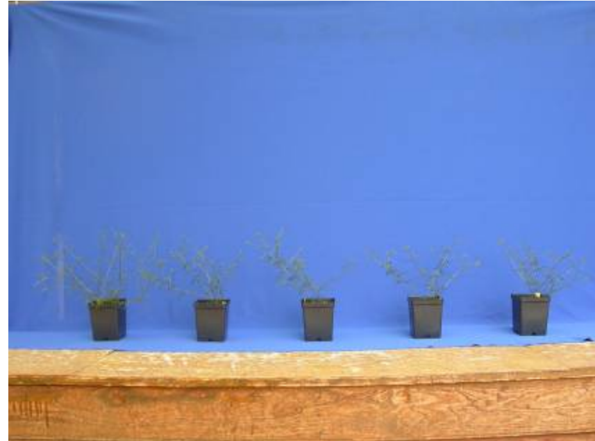
Sumagic @ 0, 15, 30, 45, 60